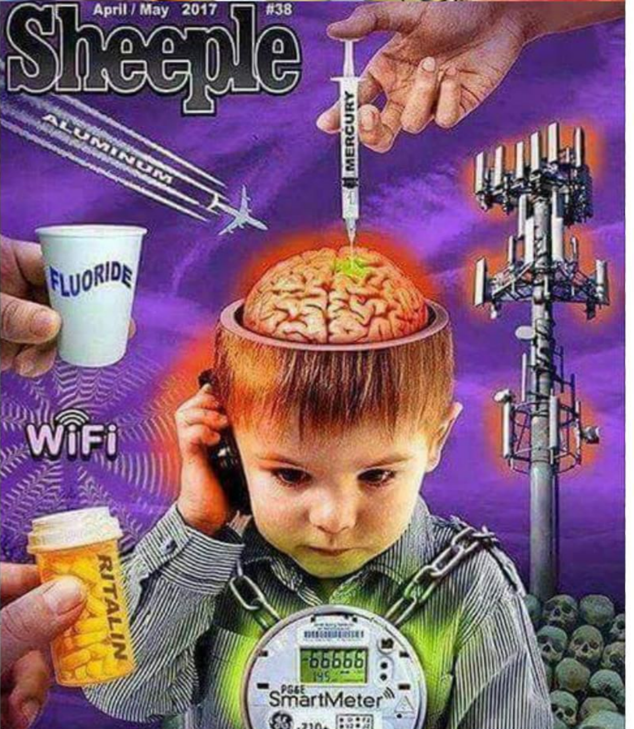
Sebastopol crowd decries PG&E's SmartMeters